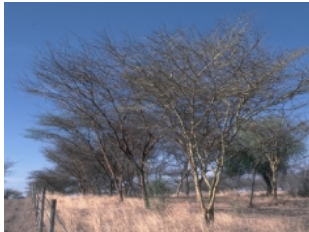
Acacia seyal with green bark. Ethiopia.